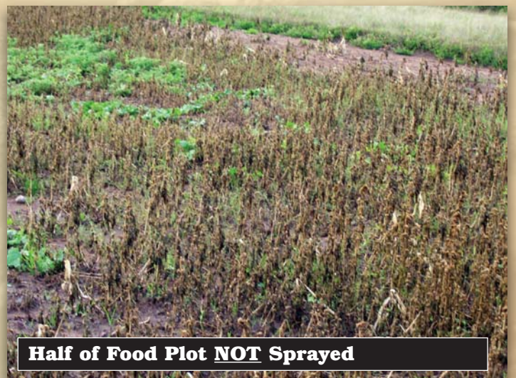
Half of Food Plot NOT Sprayed

These pictures were taken in Sept. of 2007 after an extended dry period in which rainfall totals were six inches below average. In May 2007, half of the field was sprayed with Antler Kings® PLOT MAX the other half was not. The same seed mix was planted over the entire field. This field has been limed and fertilized the same over the past 10 years. These pictures show the tremendous difference the use of PLOT MAX has made. The side of the field that was not treated with PLOT MAX literally burned up! Retaining moisture in the soil is just one of the many attributes of PLOT MAX.